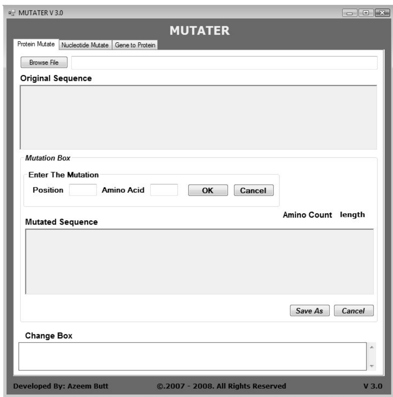
Figure 1: MUTATER GUI.

User is facilitated with two choices, Protein Mutate and Nucleotide Mutate tabs. After uploading protein sequence in the protein mutate tab, user is given two choices: 1 st to