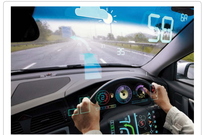
Figure 5: Driving in the future.

between driving and using the device” [9]. Many senior drivers have even problems using their car radios. In addition, there is a problem called 'automation bias,' which is created from the limiting perception of old drivers to learn how to use a new system. As Parasuraman and Riley stress “If a driver comes to rely entirely on the new system, for example, a lane-departure warning, or an intelligent cruise control system that maintains spacing between cars, he or she may eventually begin to initiate a lane-change maneuver without bothering to look, assuming that the warning system will issue a cue if the lane is occupied. However, these systems are considered convenience systems and are not designed to be safety system” [10]. Therefore, these systems and their implementation are not sufficiently reliable for someone who cannot fully understand their limitations and their benefits.