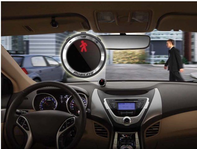
Figure 2: Self-driving car.