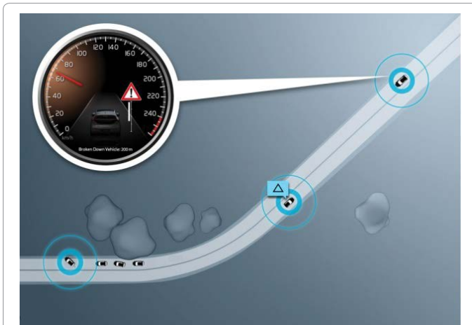
Figure 4: Car-2-Car and Car-2-Object communications technology.