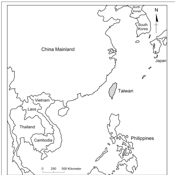
Figure 1: Overview map of the China Mainland (People's Republic of China; PRC) as well as a subtropical oceanic island, Taiwan, Republic of China (ROC)[2].

Taiwan, as an island nation, only owns an area of 36,193 km 2 of land. By May 2021, the registered population was up to 23,499,070 individuals in Taiwan 2021 by population census. Meanwhile, the registered population was up to 1,411,780,000 individuals in Mainland China by population census (Illustrated by Yi-Te Chiang) [2].