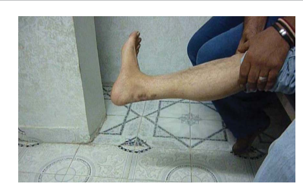
Figure 16: Twelve weeks' post-operative photo showing the patient with full dorsiflexion.