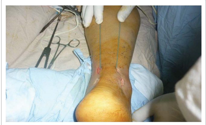
Figure 5: Intraoperative photo showing suture passed through the four distal stab incisions