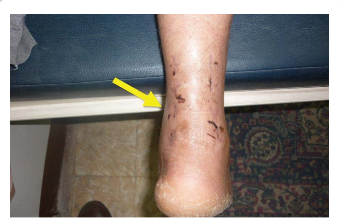
Figure 11: Four weeks' post-operative photo showing the patient in prone position and skin ischemic change resolved (yellow arrow).