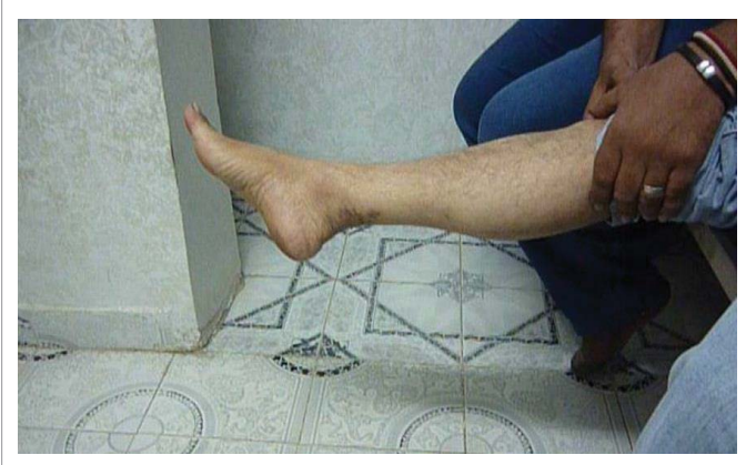
Figure 15: Twelve weeks' post-operative photo showing the patient with full planter flexion.