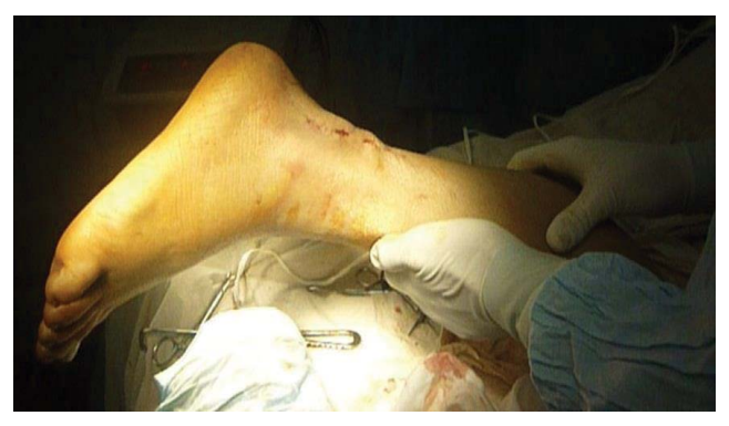
Figure 8: Intraoperative photo showing post-operative negative Thomson test with proper tendon repair (squeezing triceps surae planter flex the ankle).

The 1<sup>st</sup> case developed skin ischemic changes at the posterior ankle area that was discovered at 2 weeks postoperative during stitch removal (Figure 10). That was because we applied the plaster cast with the ankle in full planter flexion to optimize healing. So we reduced the degree of planter flexion 10 degrees and reapplied the cast. The skin condition improved greatly after two weeks (Figure 11). Later on we were keen to apply the plaster cast in 10° less than full planter flexion.