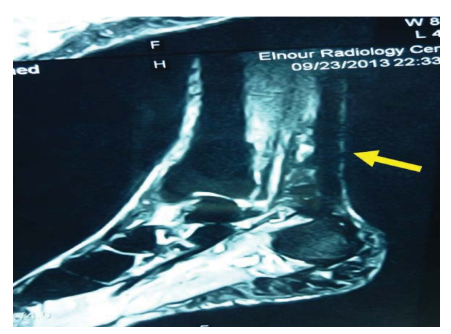
Figure 12: Post-operative MRI scan at 10 weeks showing sound tendon healing and gap elimination with no tendon hypertrophy (yellow arrow).