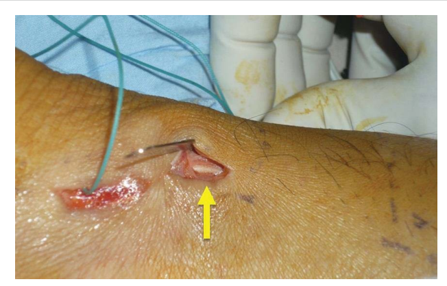
Figure 3: Intraoperative photo showing limited exposure of sural nerve (yellow arrow), straight needle passed dorsal to the nerve.

Three patients experienced transient hypoesthesia in the dermatome of the sural nerve for 3 months after the operation and resolved spontaneously. Two patients had superficial wound infection.