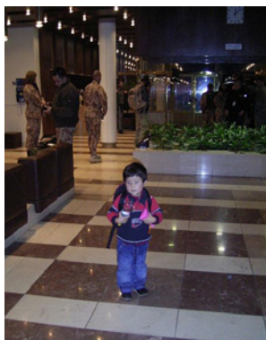
Figure 5: The same boy walking at the airport in Prague before his return home.