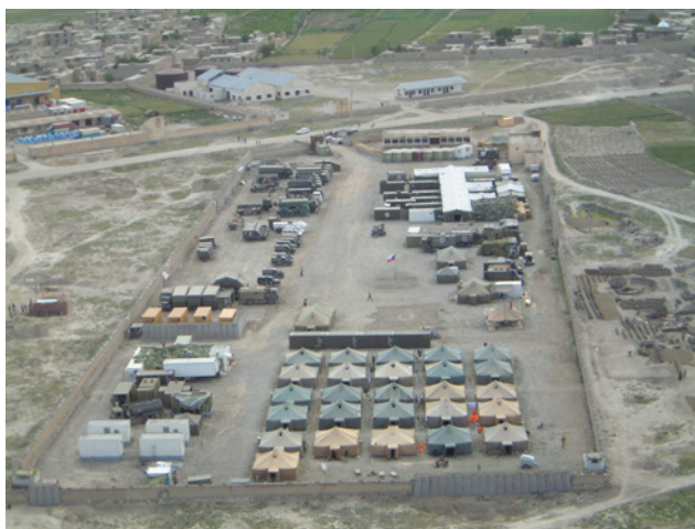
Figure 1: Ariel view on the Czech Armed Forces Field Hospital in Kabul, Afghanistan, in 2002, primarily dedicated to the humanitarian assistance to the local population.