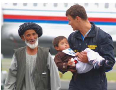
Figure 3: The same boy being transported by the military to Prague for treatment.