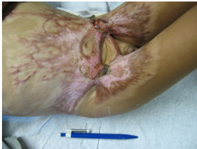
Figure 2: A small Afghani boy with severe bilateral hip contractures after burns injury, preventing his walking.