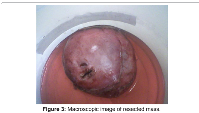
Figure 3: Macroscopic image of resected mass.