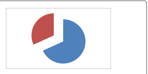
Figure 1: Weaning from ventilation, (Blue=Yes, Red=No).