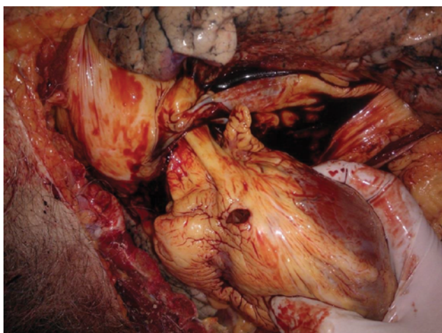
Figure 1: Myocardial laceration following stabbing with a kitchen knife (autoptic view).

During consideration of a mariticial act, two major perspective need to be addressed: the situational, and the evolutionary one. There are obvious sex differences in aggressive behavior, pertaining prevalence, means of perpetrating violence, and other derivatives of the issue. Stabbing injuries should not be considered from a merely forensic iconography standpoint, since the weapon used will reflect the motivations for the killing [15]. Motivational drives of mariticial acts are collected from perpetrators' interviews and hearings, and therefore can be object to different biases, mainly from insincerity that generally characterizes the perpetrators' confessions, but for other reasons as well [16]. The more often use of weapons from women during husbandicide has been given different reasons, such as the premeditation of a self-defence in the setting of a chronic physical abuse from the spouse, but as well as an attempt to offset the strength difference between men and women [17].