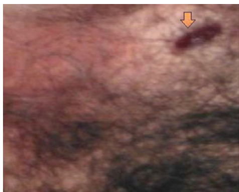
Figure 2: Surface wound; a left parasternal incision mark (arrow).