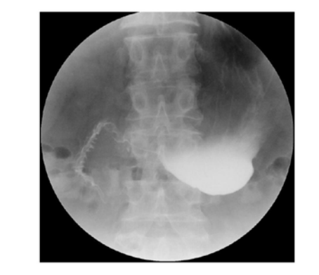
On day 45, upper gastrointestinal series showed advanced pyloric stenosis Figure 4: Upper gastrointestinal series (Stomach).