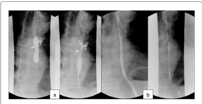
a. On day 40, ballooning on the area of stenosis was performed b. On day 45, upper gastric series showed improved esophageal stenosis Figure 3: Upper gastrointestinal series (Esophagus).

In this case, the patient developed repeated infections which were thought to be caused by bacterial translocation.