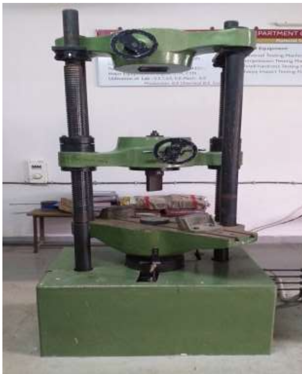
Fig no. 9 universal testing machine (utm)