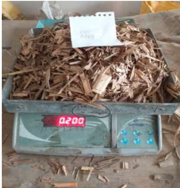
Fig no 5. 200 gm. Dry sugarcane leaves.