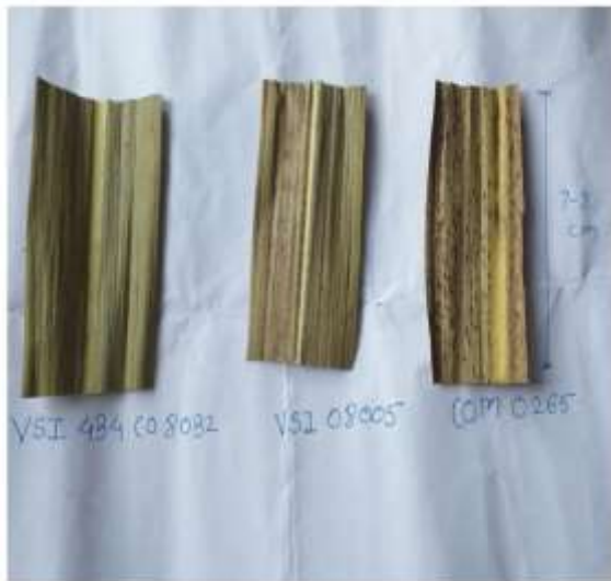
Fig no.2 varieties of sugarcane leaves.