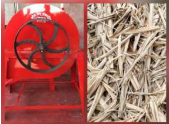
Fig no. 3 cutting machine / chaff cutter

First upon size reduction of sugarcane leaves is done by chaff cutter up to 1-2 cm as shown in fig 3.