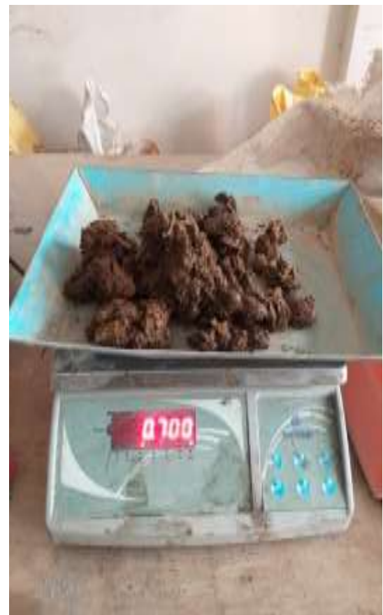
Fig no 4. 700 gm. Cow dung (binder)

adjusted over the sample. The load was gradually applied on the sample. It was observed that at high load original moisture content of sample comes out along with some amount of binder. 22 KN load require for cow dung & 11 KN load require for buffalo dung. After removal of sample from die the briquette gets disintegrated. As per our experiment to all varieties of briquettes are formed at optimum pressure that is 18 KN. Our experiment carried out by using utm machine as shown in fig 6. Therefore further experiments were carried out at lower load. Briquettes making method shown in fig 10