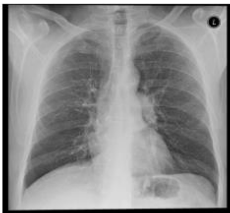
Figure 1: Lung Cancer X-Ray.