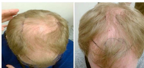
FILENAME: g99_3.jpg Took anabolics (creatine)