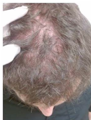
Change of texture of hair and even diffuse thinning throughout affected areas. This 27-year-old male used creatine for 4-5 months. His hair loss is commonly recognized to be from anabolic creatine since it has a very even, diffused pattern, and the hair has a change in texture.

A second lifestyle choice compared vegetarians and meat eaters. In vegetarians, there was no evidence that available androgens were higher. Although IGF-1 was 9% higher in meat eaters, further studies should be done to determine the amount of actual hair loss from elevated levels [51]. A further study showed there was very little difference in IGF-1 levels with animal or vegetarian diets [52]. Soy is another very common protein for working out. Surprisingly though, of all the supplemental proteins, it has the highest amount of arginine per