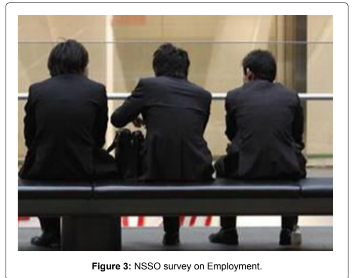
Figure 3: NSSO survey on Employment.

Fact 1: The ratio of employed persons from that age group is declining, as a measure called age-specific worker population ratio (ASWPR) shows. In 1999-2000, the ASWPR for young rural males was 741 out of 1000. It went up to 742 in 2004-05 and then slipped to 648 and 616 in 2009-10 and 2011-12. It's the same story for rural women