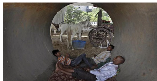
Figure 1: Human society depends upon the opportunity.

There are number of reasons why youth at risk both in domestic and professional life. The youth at different stages face some of the