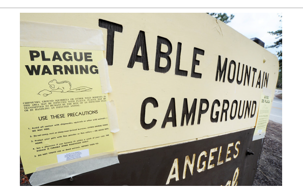
Figure 2a: Table Mountain Campgrounds in the Angeles National Forest near Wrightwood, CA, (closed to the public as of July 24^{th} 2013)

Figure 2a depicts a Plague Warning sign at the Table Mountain Campground in the Angeles National Forest Thursday, July 25, 2013. Closure signs were posted at three other campgrounds: Broken Blade, Twisted Arrow and Pima Loops of the Table Mountain Campgrounds in the Angeles National Forest near Wrightwood due to plague found in a ground squirrel. All these sites were officially closed at 1:00 p.m. Wednesday, July 24, 2013 for duration of at least 7 days.