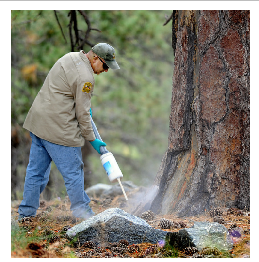
Figure 2b: Plague countermeasures at Table Mountain Campgrounds in the Angeles National Forest near Wrightwood, CA. Figure 2b depicts crews from the County of Los Angeles Agriculture Weights and Measures were spraying Delta Dust to kill the fleas from squirrels and chipmunks around the entrance of burrows and at the base of trees containing squirrel nests in the same area. (Photo by Walt Mancini/SGVN; reprinted with permission).

Figure 2a depicts a Plague Warning sign at the Table Mountain Campground in the Angeles National Forest Thursday, July 25, 2013. Closure signs were posted at three other campgrounds: Broken Blade, Twisted Arrow and Pima Loops of the Table Mountain Campgrounds in the Angeles National Forest near Wrightwood due to plague found in a ground squirrel. All these sites were officially closed at 1:00 p.m. Wednesday, July 24, 2013 for duration of at least 7 days. (Photo by Walt Mancini/SGVN; reprinted with permission).