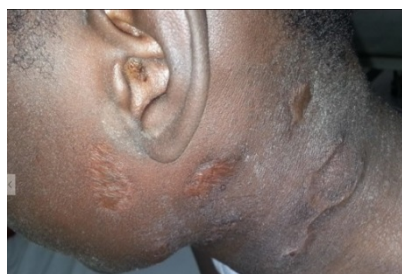
Figure 1: Abscess scar.