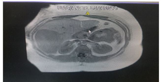
Figure 1: MRI findings: Voluminous iso-intense lesion in right hepatic lobe.

Differential diagnoses included Focal Nodular Hyperplasia (FNH), Inflammatory Adenoma, Giant Atypical Hemangioma and, less likely, Fibrolamellar Hepatocarcinoma. Hepatitis B and C virus and Alpha fetoprotein were negative.