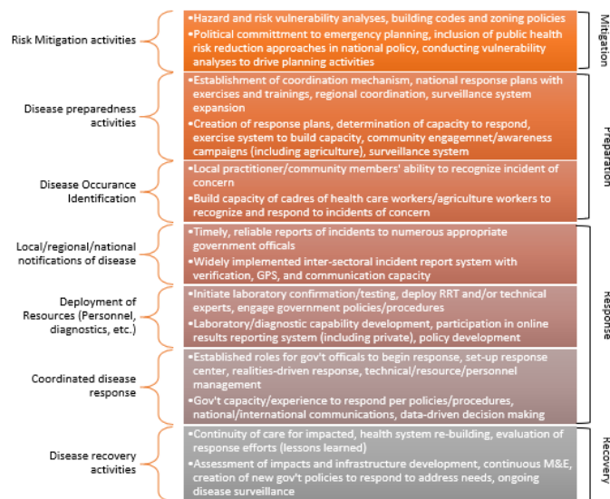
Figure 3: Cascade of EID Response with Potential Points of Engagement.

There were clear strengths and limitations to our review. Strength of the review was that the use of the specific eligibility criteria and search process made narrowing down relevant articles efficient and straightforward. A limitation of the review was that the search could have been more comprehensive with the inclusion of other databases. However, for the two databases used – scaling the search to the past ten years provided a significant amount of relevant search results.