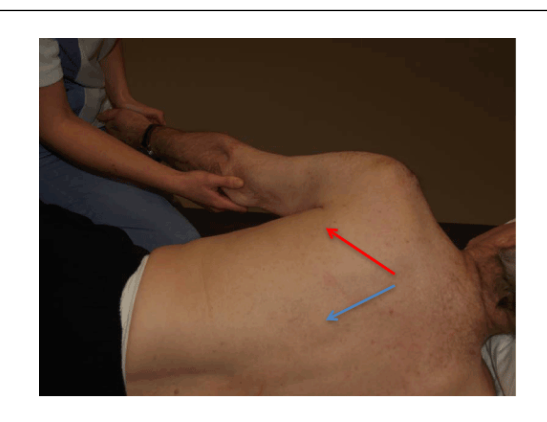
Figure 6: scapula setting: concentric activity of serratus anterior (red), and trapezius, pars ascendens (blue)

Lateral position on the non-affected side