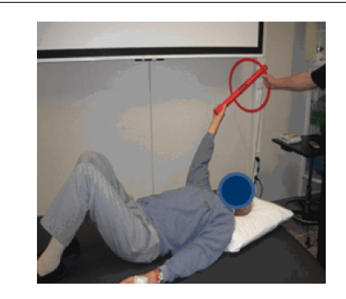
Figure 5: Functional task: "Follow the ring with the stick": eccentric activity of pectoralis major the internal rotator of the shoulder, concentric activity of triceps, supinators and wrist extensors.

The relationship between core stability and scapula setting is best addressed in the lateral position on the non-affected side. Scapula setting can be exercised in preparation of reaching and grasping. The goal of therapy in this position is scapula setting, shoulder protraction (serratus anterior), concentric and eccentric control of external rotators of the shoulder and deltoideus, pars posterior, concentric and eccentric activity of triceps brachii. A task is chosen in which grasping is included. Finally, this position inhibits the non-affected side in case of over-activity (Figure 6).