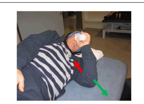
Figure 2: "Bring the cup to your mouth and put it back on the Table". The objective of the therapist: eccentric control of internal rotators of the shoulder, eccentric and concentric control of biceps and triceps, eccentric control of the pronators of the forearm when returning to starting position. Green arrow: extension of elbow, eccentric activity of elbow flexors. Red arrow: elbow flexion, eccentric activity of triceps.

In this position, the trunk, scapula and upper arm are passively stabilized. The arm is positioned in 90° of ventral flexion, which mimics a reaching position. The patient has a lot of visual information about the position of the arm and hand and in lateral lying proprioceptive and sensory information increases (Figure 2).