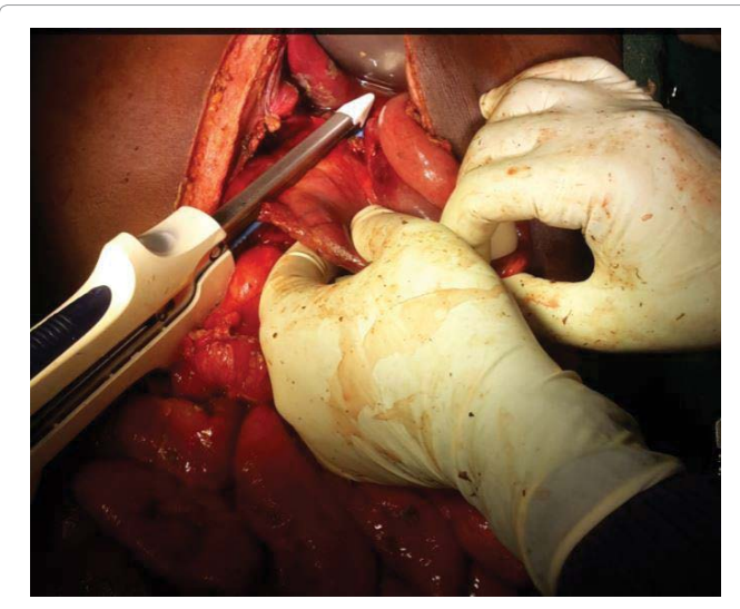
Figure 3: Transverse stapler being applied at the distal end to resect the stoma