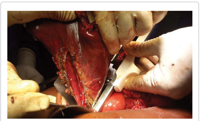
Figure 4: Linear Stapler applied proximally to resect the stomach and do oesophageojeunal anastomosis.