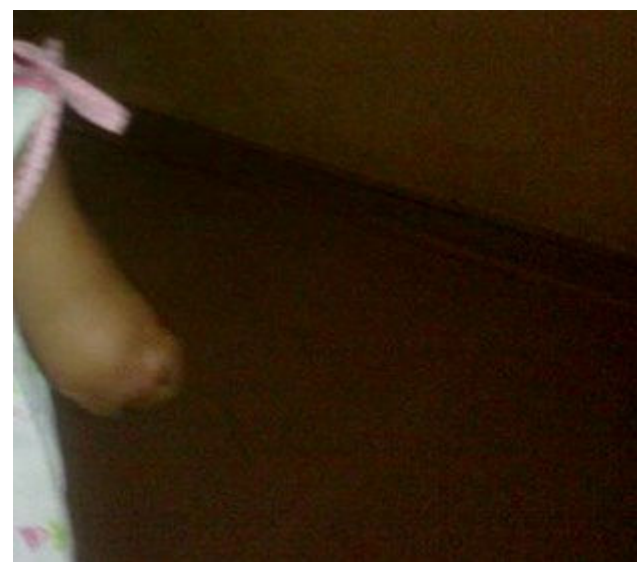
Figure 5: Elbow amputation of the left upper limb.