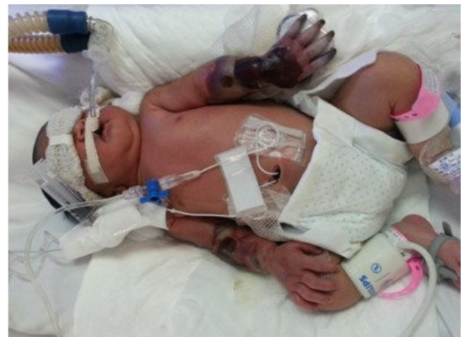
Figure 1: Patient under ventilation on the second day after birth with evident gangrenous lesion of both upper extremities.

The right forearm had a small patch of gangrene with irregular areas of edema and bluish discoloration, extending to the hand (Figure 1).