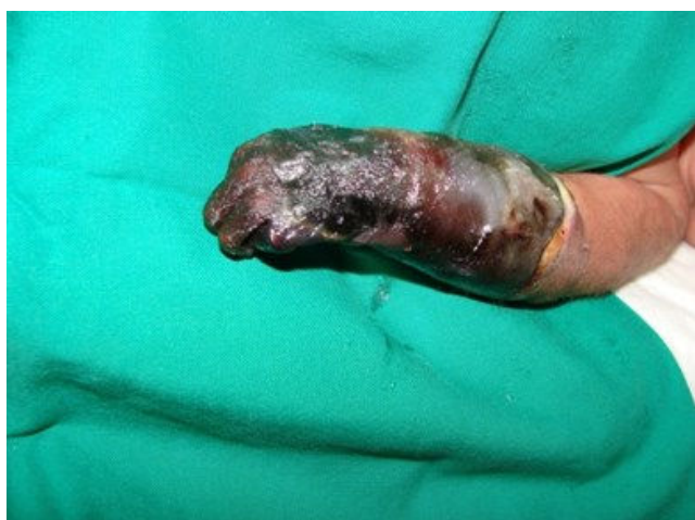
Figure 3: Dry gangrene involving the left hand and most of the left forearm.

The infant was administered low molecular weight heparin for one month. She was also given a course of antibiotics for 2 weeks and fresh frozen plasma daily for 17 days. The right forearm and right hand were healed with the treatment; and on the third day, duplex ultrasound showed triphasic signals over right brachial and radial arteries. Local debridement of the ulcerated lesions was done, till it was clean with development of healthy granulations and ready for reconstruction. Unfortunately, dry gangrene was propagated to involve the left hand and most of the left forearm (Figure 3).