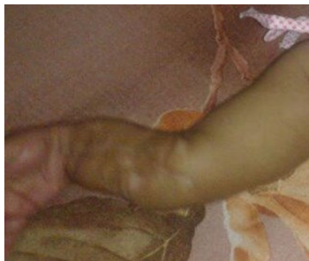
Figure 4: Scarring at the right forearm 6 months after birth.

Moreover, screening of factors including activated protein C resistance, factor V Leiden mutation, free protein S concentration, prothrombin mutation (G20210A), total protein C concentration, anti-phospholipid antibodies total protein S concentration, homocysteine and anti-thrombin concentrations were also carried out. The vascular surgical team followed the patient till a clean line of demarcation was formed. The patient was discharged after 30 days and went to India, where the amputation was done (Figures 4 and 5).