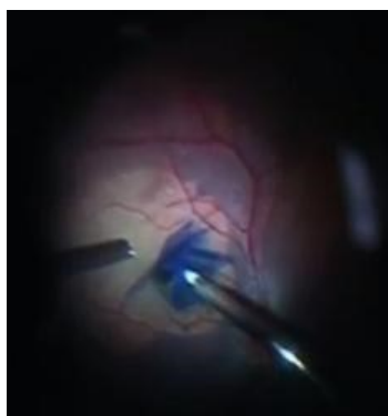
Figure 1: BBG-stained ILM flap over idiopathic macular hole.

Brilliant blue G dye (ILM blue, D.R.O.C, Netherland) was injected into the fluid filled vitreous cavity and was left for about 20 seconds. Excess dye was actively aspirated with the vitrectomy cutter followed by ILM peel using tanoscrafer and ILM forceps (D.R.O.C, Netherland) for at least 2 DD around the fovea. During the circumferential peel, the ILM was not removed completely from the retina but was left attached to the edge of the macular hole (Figure 1). The peeled ILM was adequately trimmed and a small amount of viscoat (Alcon, Fort Worth, TX, USA) was applied to the edges of the macular hole in a circular manner to act as an adhesive. The trimmed ILM flap was then massaged gently over the macular hole from all sides until a thin layer of ILM covered the macular hole. This was followed by fluid-air exchange with 25% SF6 gas. Postoperative face down positioning for 7 days was adopted. Postoperatively, patients were examined in the 1st day, 1st week, 2nd week, 1st month, and then monthly till the end of the follow up period of 12 months.