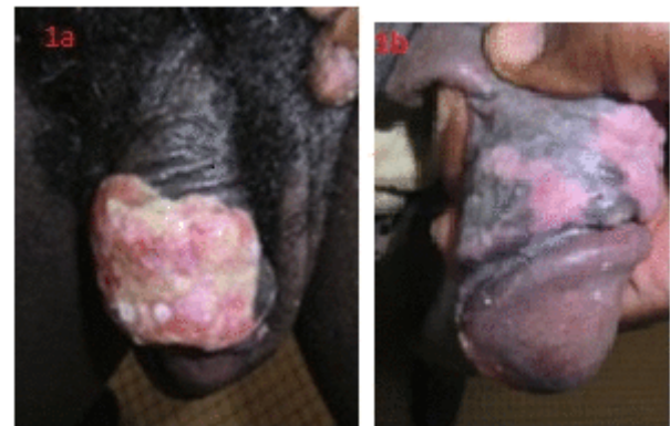
Figure 1: (a) Showing ulcer was infiltrated and became a growing tumoral-like ulcer. (b) Showing relapse was not observed.

infiltrated and became a growing tumoral-like ulcer. It was painless, and displayed lymphatic discharge (Figure 1a).