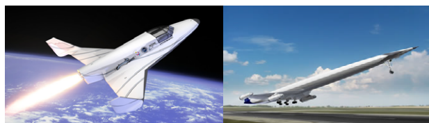
Figure 1: Examples of a new generation of spacecraft and aircraft. Project created by the XCOR Aerospace (on the left) and a European design project called LAPCAT A2 (on the right).