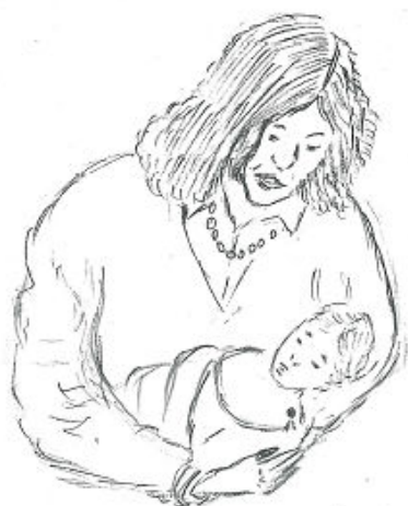
Figure 4: When it comes to raising children, many mothers cling to the old practices, even if some of them contrast with the advice provided by modern medical authorities. (illustration by the author).

(A few days later Mahmud's father renews his "strong plea for his son's being deferred until the next year; this the Muhtar accepts". The author hereby stresses that birth days of these young men are known only approximately. He also describes the physical examinations of the youths by the army doctors).