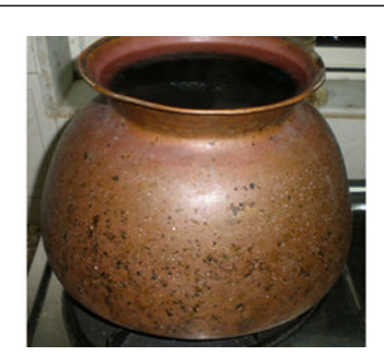
Figure 1: Copper vessel used for boiling water.

copper vessel (Figure 1), and then letting it cool to room temperature before distributing it into bottles and refrigerating.