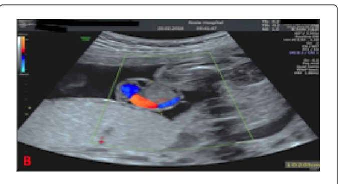
Figure 2: Antenatal ultrasound image at 22 weeks of gestation.

During the antenatal surgical counseling at 22 + 4 weeks of gestation, the exomphalos sac size was 30 \times 20 \times 20 mm. It had presumed bowel content but note was made of a cystic structure of uncertain etiology (possible bowel dilatation) at the base of the exomphalos, measuring 8 \times 10 \times 10 mm (Figure 2). The appearance of the stomach and intra-abdominal bowel was normal, other abnormalities included an apical muscular ventricular septal defect and micro-array detected duplication of 11q22.1 to 11q22.2 and 11q22.3 to 11q23.1.