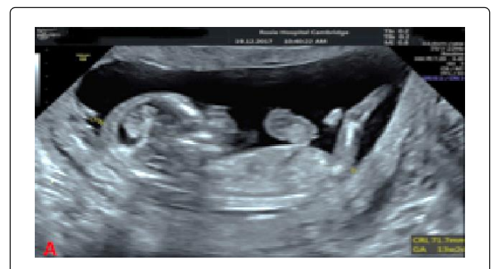
Figure 1: Antenatal ultrasound image at 13 weeks of gestation.

A term baby boy was born at 38 + 4 weeks of gestation at our institution with an antenatal diagnosis of exomphalos made at 13 + 6 weeks of gestation (Figure 1).