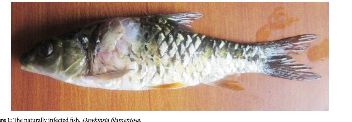
Figure 1: The naturally infected fish, Dawkinsia filamentosa.

The diseased moribund freshwater fish, D. filamentosa (Figure 1) (N=10; SL= 75.8-106.5 mm) were collected from Cauvery Reservoir of