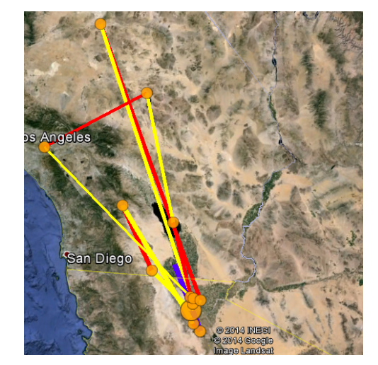
Figure 3: South California Spatial Connection Model.

zone, earthquakes primarily clustered off the coast and minimal earthquakes occurred on the landmass. In South California, the earthquakes primarily clustered in a linear pattern and no occurrences were reported off the coast of Southern California. Geological analysis must be done to identify more information to allow for the development of optimal earthquake prediction methods. Further methods must be analyzed and triangulated to arrive at an accurate prediction of earthquakes (Table 2).