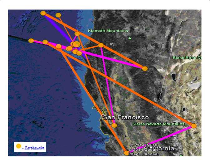
Figure 2: North California Spatial Connection Model.

Table 2: Earthquake Prediction Results Table for North California and South California.