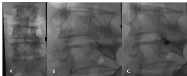
Figure 1: A: P-A fluoroscopy projection illustrating a degenerated L4-L5 right facet joint (patient is in prone position). B: Oblique ("Scottie Dog" projection) fluoroscopy view with the needle inside the L4-L5 right facet joint (posterolateral approach) C: Oblique ("Scottie Dog" projection) fluoroscopy view post contrast medium injection verifying the proper needle position (dispersion of the medium inside the articular space with no evidence of intravascular access).

Fluoroscopy, Computed Tomography or Magnetic Resonance can be used as guidance imaging methods for percutaneous spinal infiltrations. Fluoroscopy is governed by the advantage of real time imaging during needle progression and especially during contrast medium injection which will verify the extravascular and intrarticular needle positioning. Computed Tomography provides more detailed anatomy of the region of interest. Magnetic Resonance although lacking