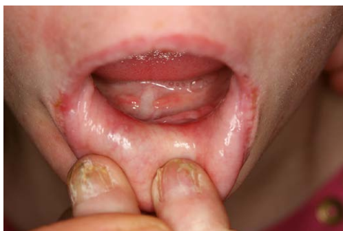
Figure 5: Hypodontia.