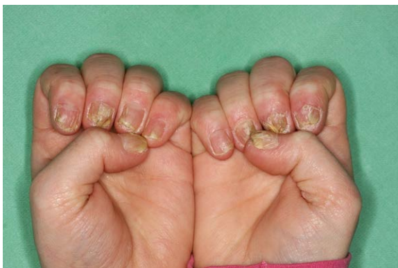
Figure 4: Dystrophic nails.