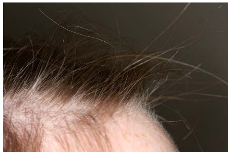
Figure 2: Hypotrichosis of the scalp hair.