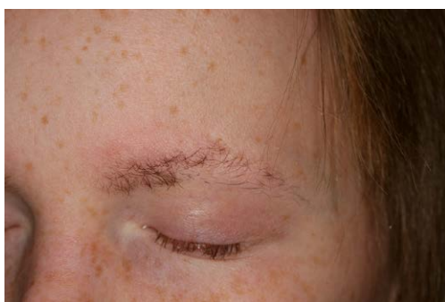
Figure 3: Hypotrichosis of the eyebrows and eyelashes.