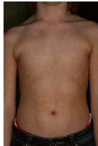
Figure 1: Athelia.

Ectodermal dysplasias are heterogeneous group of inherited disorders that are defined by primary defects in the development of two or more tissues derived from embryonic ectoderm. The tissues primarily