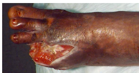
Figure 6a: Case 5 before HBOT.