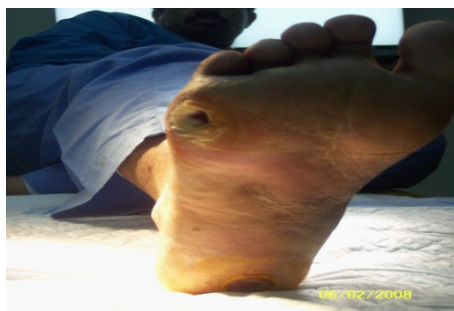
Figure 5a: Case 4 before HBOT.