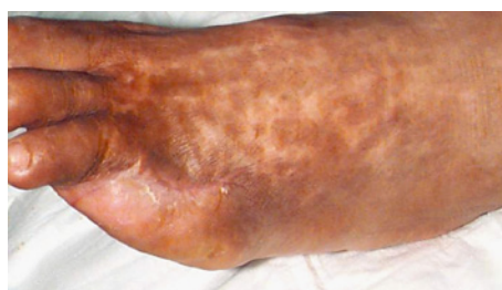
Figure 6b: Case 5 after 60 sessions of HBOT.

approximately 1% requiring lower extremity amputation. The risk of amputation for those patients is greater than for the non-diabetic population [15,17].