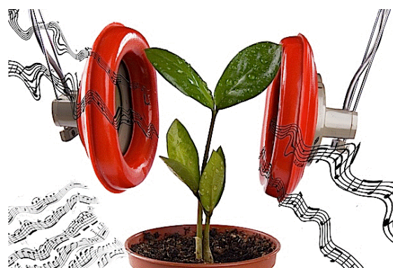
Figure 2: Plants grow better when exposed to either classical music or classical mantras.

Similar effects are seen with Mantra recitation (Figure 2) [10].