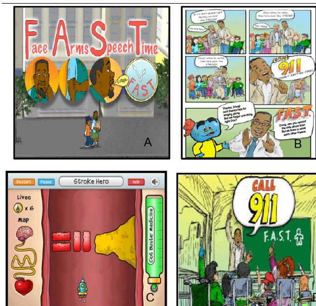
Figure 1: Sample Hip Hop Stroke media. A: “Keep Your Brain Healthy”: Animated feature showing the FAST mnemonic; B: Hip Hop Stroke Comic book; C: “Clotbuster” video game; D: “Stroke Ain’t No Joke”: Animated feature.

and the potential therapeutic benefit of early hospital arrival. The intent of the intervention is that the children will then educate their parents and community members with the stroke knowledge they have gained.