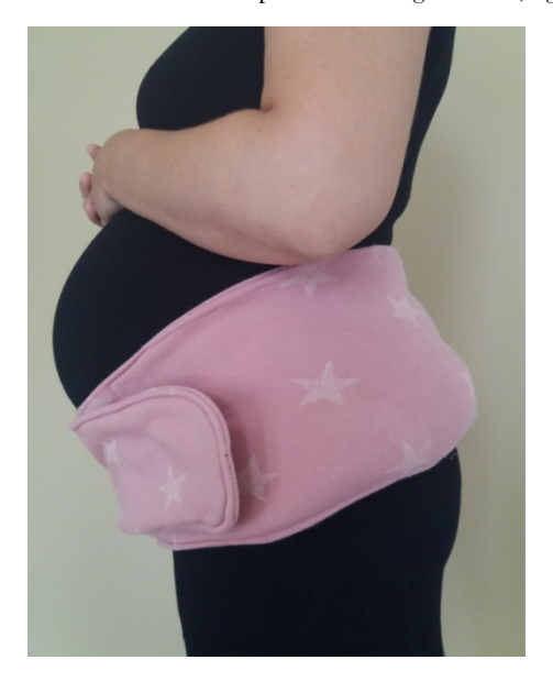
Figure 1: The thermal belt.

The thermal belt is an elastic belt, adjustable to the pregnant woman's pelvic perimeter without compressive effect which allows to apply thermotherapy on the lumbar and the pelvic areas in order to relieve labour pain. To apply the thermotherapy, heat or cold pads are placed inside each pocket. The two-pocket system makes it easier to remove and to change the pads as well as to wash the different parts. The belt covers both lumbar and suprapubic areas, which are the areas that women refer to be as the most painful during labour (Figure 1).