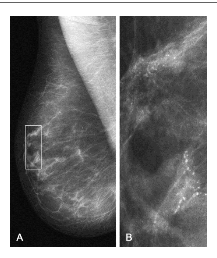
Figure 1: A-Right breast mammogram showing two groups of microcalcifications within an area of parenchymal distortion. B-Detail of the suspicious area.

quadrantectomy with sentinel lymph node biopsy followed by radical modified right mastectomy.