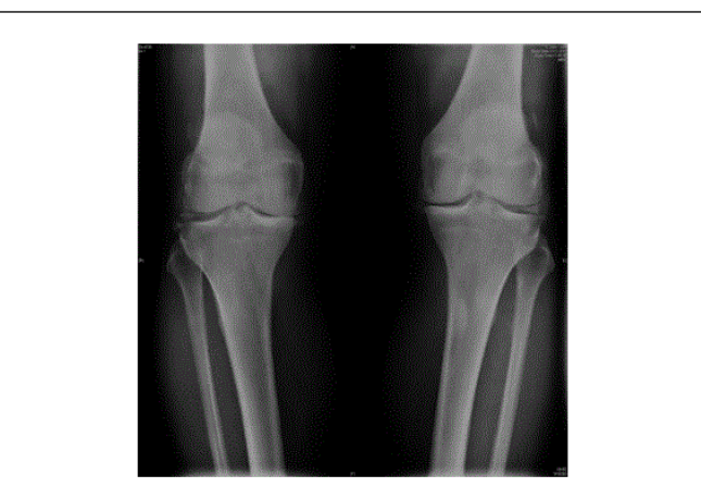
Figure 1: X-rays of proband showing classical chondrocalcinosis in knees.

Table 1: Characteristics and SLC12A3 gene variants identified in the proband and in thirteen individuals of his family pedigree. The proband is indicated by bold.