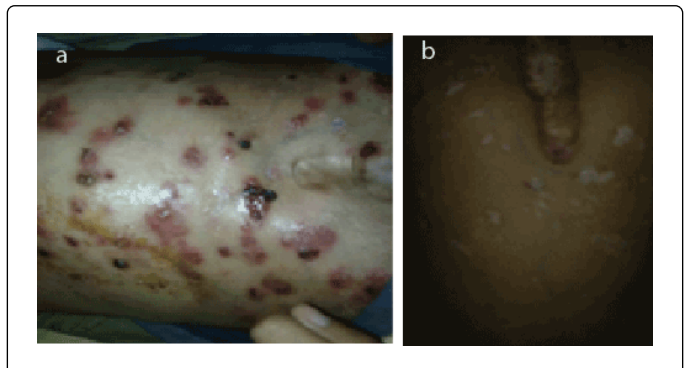
Figure 1: Widespread cutaneous active lesions (a) & healed lesions (b)

weighed 26 kg at first visit. Cardiovascular system was normal and chest was bilaterally clear. Liver and spleen were non palpable. Biochemical parameters for blood sugar, liver function and renal function were within biological reference ranges. Hb was 10.5 gm% and total leucocyte count 12300/µl (polymorphs 80, lymphocytes 18 and monocytes 2). Serology for HBsAg, HCV and HIV was nonreactive. Pyogenic cultures for blood, urine, stool and pus were sterile. Pus aspirated from the pustules was processed for fungal culture also but there was no growth after two weeks of incubation. Pus from the pustular lesions showed acid-fast bacilli in Ziehl-Neelsen stain. Histopathological examination of skin biopsy from the lesion site showed granulomatous reaction. Multiple retroperitoneal lymph nodes were enlarged in contrast enhanced computerized tomography.