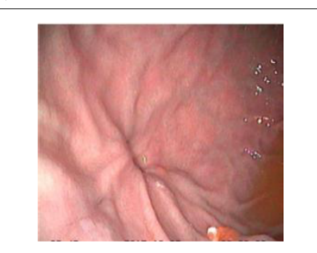
Figure 3: Endoscopic image of gastric fundus and mouth of the diverticulum.

In the case of an asymptomatic gastric diverticulum there is no specific treatment, it is related to the degree of symptoms of the patient has and could be attributed to the diverticulum. PPI therapy for a few weeks can resolve symptoms in some cases, however in some patient's symptoms such as dyspepsia and epigastric pain will be refractory to inhibition of acid secretion [4]. Surgical treatment is recommended for long, symptomatic diverticula and complicated with perforation, bleeding or suspected of malignancy, laparoscopic and open resection has been successful [5]. Surgical treatment of gastric diverticulum through laparoscopy was described since 1998 with excellent results (Figures 3 and 4) [6,7].