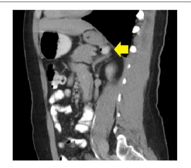
Figure 2: CT-scan-sagittal section observing diverticulum on the posterior wall of the stomach containing contrast medium and air.