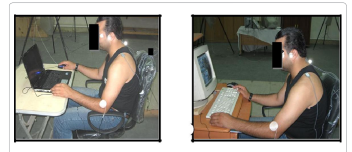
Figure 1: Laptop and desktop sitting styles with marker placement sites on: craniocervical angle, outer canthus of the eye, ear tragus and on C7 spinous processes.

At the end of fifteen minutes in each position the EMG triggered the motion capturing system to begin recording simultaneously for 5 seconds aiming at relating the muscular load to the postural change [11]. Angles' calculation is 3D angle: It was the real angle of the joint in all planes X, Y and Z without neglecting the rotations of the joint as in 2D angles. The craniocervical angle is the angle between the line from the tragus to the outer canthus of the eye and the line from the tragus to the C7 spinous process. Data were collected in three sheets: personal data sheet, motion analysis sheet, and EMG sheet and stored on a removable memory card. Paired samples t-test was used to evaluate the statistical difference between the two styles at p = 0.05. For the camera, the Qualisys ProReflex motion capture analysis system was used, where a Proreflex Motion Capture Unit (MCU) utilizing infrared light