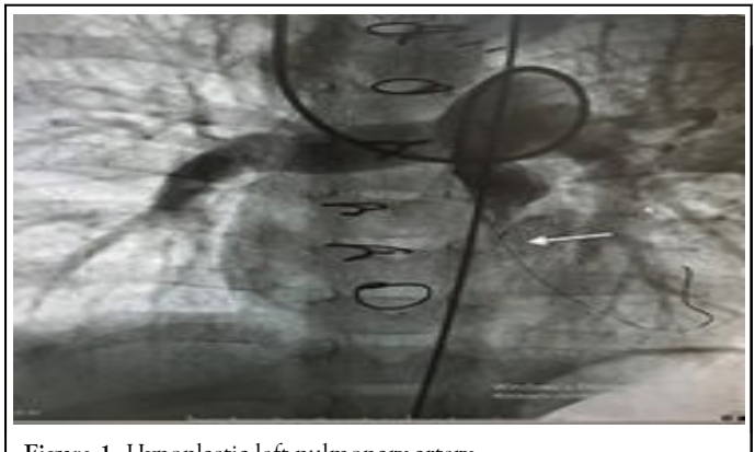
Figure 1: Hypoplastic left pulmonary artery.

Left pulmonary artery of a patient with TGA+PS was critically hypoplasic. We completed the Fontan circulation in this patient with the existing unilateral right pulmonary artery (Figure 1).