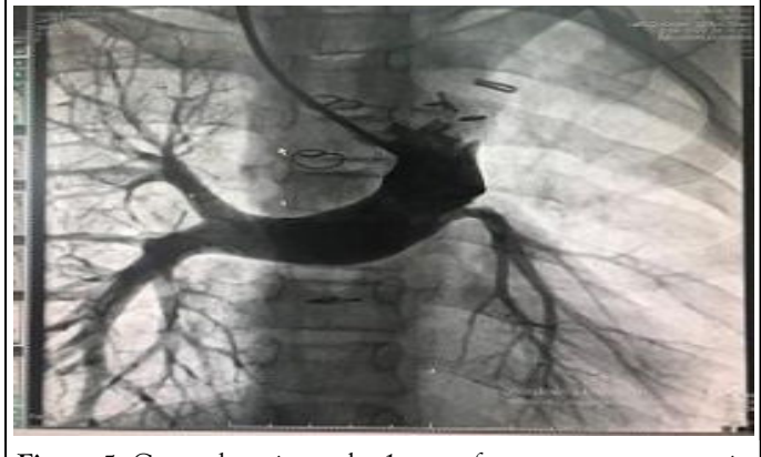
Figure 5: Control angiography 1 year after surgery, no stenosis in fontan anastomosis and fenestration spontaneously closed.

One patient had partial graft thrombosis 3 months after discharge. The patient was hospitalized and a 1-week medical treatment was performed. The patient was discharged as the symptoms regressed. In addition, cardiac functions were seen well on echocardiography. In the postoperative 1-2 year echocardiographic follow-up of all patients, the functional single ventricle ejection fraction value was measured as 63.4 \pm 10\% (p=0.085). NYHA capacity of the patients was evaluated as 1 or 2. Postoperative findings of all patients were shown in general (Table 3).