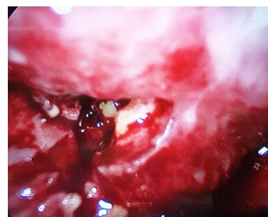
Figure 2: Intraoperative image- direct visualization of the fistula.