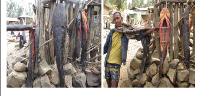
Figure 2: Gutted Clarias gariepinus fish at the marketing place.

Many other medium sized with the range of 70 and 80 cm whole fresh gutted and washed Clarias gariepinus and Heterobranchus longifilis were also recorded. Large Labeobarbus intermedius fish species appear at the market in sun dried forms filled with sacks. Big sized gutted fresh whole fish sold from 40 to 50 Ethiopian birr. During market transaction period most of the time customers are women from peasant associations. This simply shows the livelihood and income contribution of Jemma and Wonchit river fisheries for the smallholder farmers. A study by Okeowo also showed that the business of artisanal fishing is profitable in both locations [25].