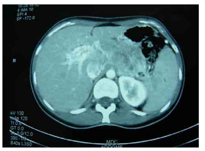
Figure 2: Portal vein Thrombosis.