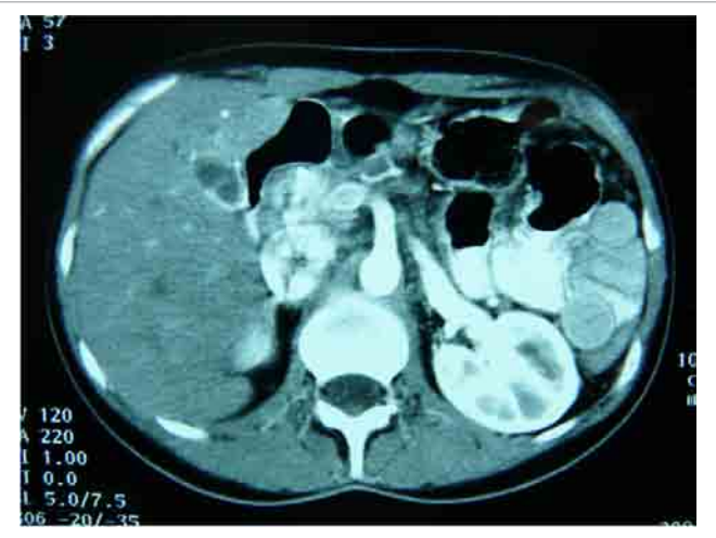
Figure 3: Reconstruction of Portal vein with 10 mm PTFE prosthesis.

the admittance were normal also including endocrine biochemical markers with the exception of serum SS which resulted slightly elevated. Even if not fully supported by radiological and biochemical evidences the patient was diagnosed with suspected invasive NFEPT on a clinical/radiological basis and a SS receptor scintigraphy was planned. This latter examination did not contribute to preoperatively clear the diagnosis, but in consideration of the high clinical suspicion, the age of the patient, the ongoing symptomatology and the clear invasive attitude of the mass, the patient was scheduled for an explorative staging laparoscopy and, if permissive, to a laparotomic radical surgery with a curative intent.