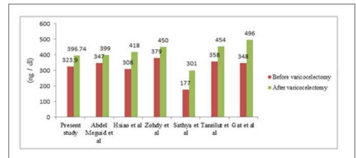
Figure 3: Comparison of improvement in serum testosterone level before and after varicocelectomy between present study and previous studies.

study mean serum testosterone level improvement at 6 months after varicocelectomy was by 72.84 ng/dl (22.49%). Hsiao et al (Table 4) (Figure 3) reported an increase in mean serum testosterone level after varicocelectomy from 308.4 ng/dl to 417.5 ng/dL with a mean increase of 109.1 \pm 12.8 ng/dl. Zohdy et al. (Table 4) (Figure 3) reported improvement in mean serum testosterone level from 379 \pm 250.8 ng/dl to 405.1 \pm 170.2 ng/dl [28]. In our study, the mean serum testosterone level was noted to improve from 323.90 \pm 67.81 to 396.74 \pm 40.88 ng/dl at 6 months after varicocelectomy.