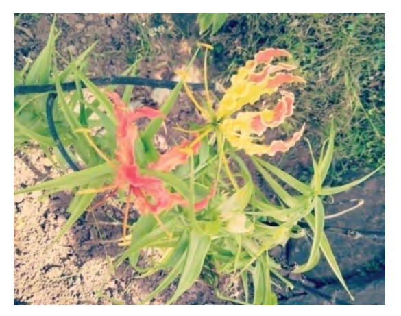
Figure 14: Gloriosa superba L.