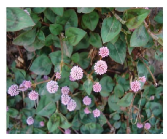
Figure 32: Polygonum capaitatum Buch.