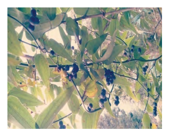
Figure 36: Smilax aspera L.