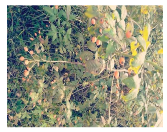
Figure 34: Rosa moschata Herm.