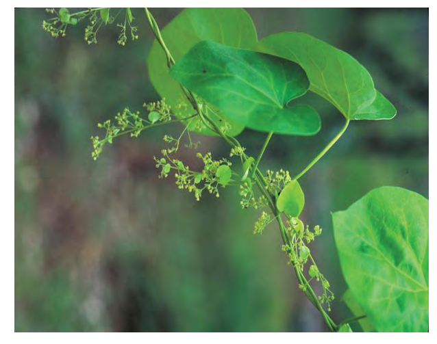
Figure 3: Cissampelos pareria L.