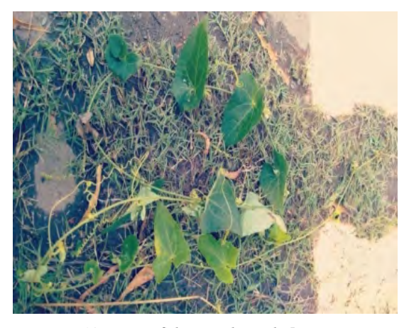
Figure 37: Solena amplexicaulis Lam.