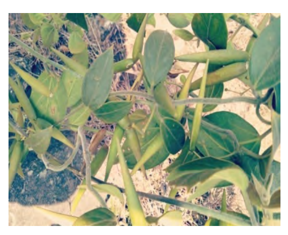
Figure 40: Tylophora hirsuta Wight.