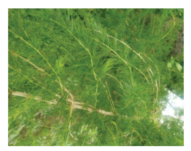
Figure 1: Asparagus racemosus Willd.