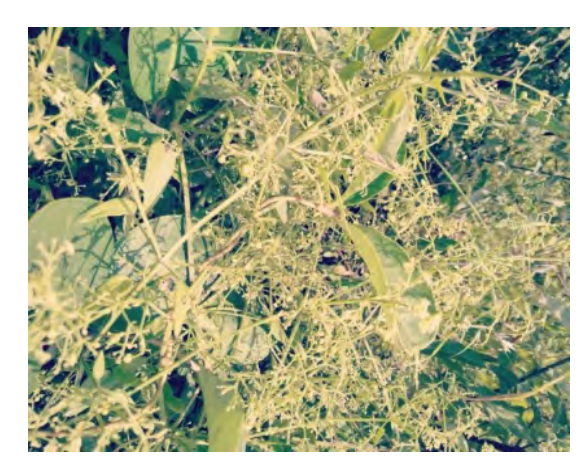
Figure 35: Rubia cordifolia L.