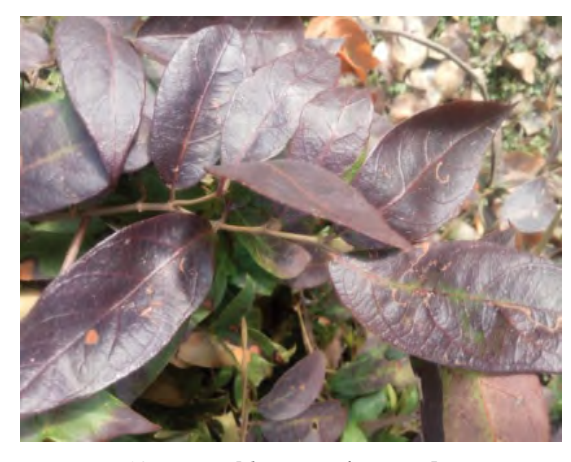
Figure 17: Ichnocarpus frutescens L.