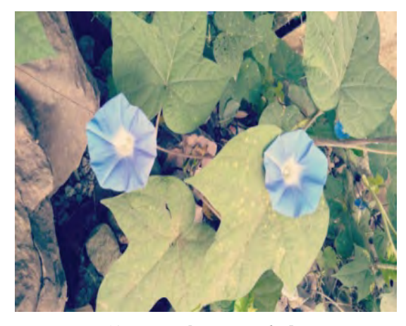
Figure 21: Ipomoea tricolor L.