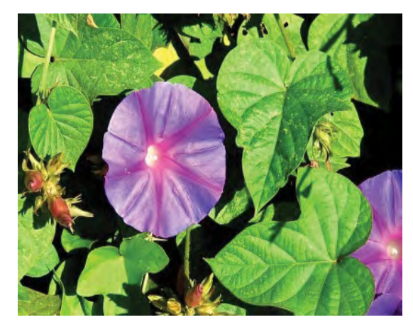
Figure 18: Ipomoea indicia (Burm. F.)