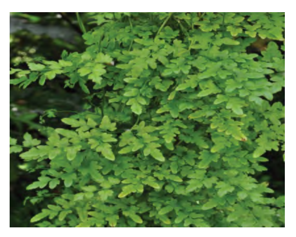
Figure 28: Lygodium japonicum.