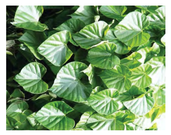
Figure 38: Tinospora cordifolia (Lour.).Merr.