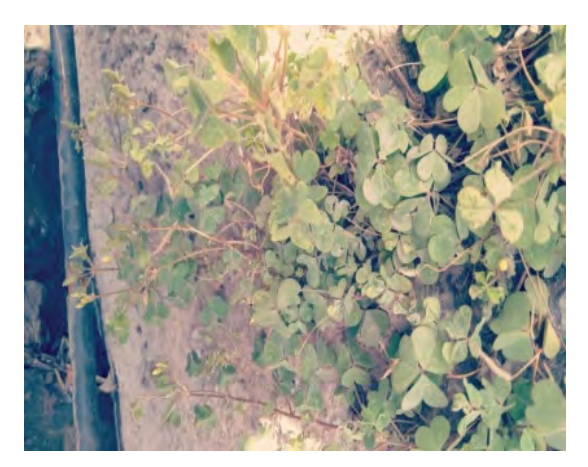
Figure 31: Oxalis corniculata L.