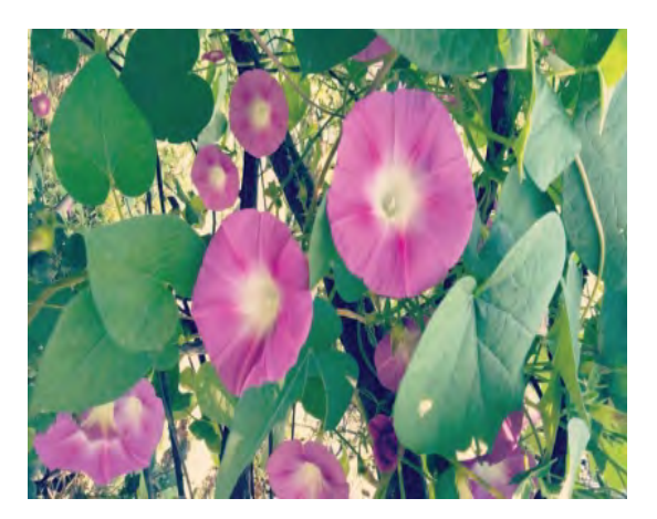
Figure 20: Ipomoea purpurea (L.)