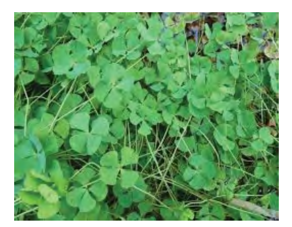
Figure 30: Marsilea quadrifolia L.