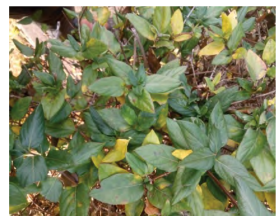
Figure 25: Lonicera quinquelocularis Hardw.