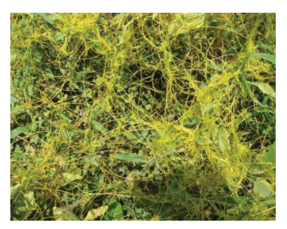
Figure 7: Cuscuta reflexa Roxb.