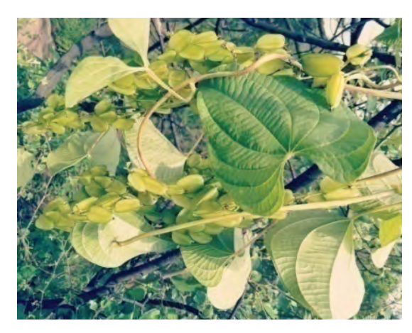
Figure 8: Dioscorea alata L.