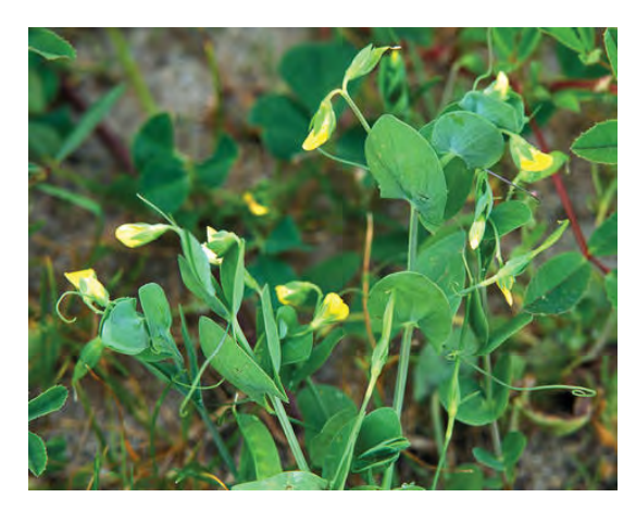
Figure 24: Lathyrus aphaca L.