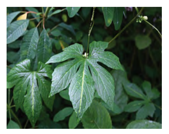
Figure 27: Luffa cylindrica L.M. Roem.