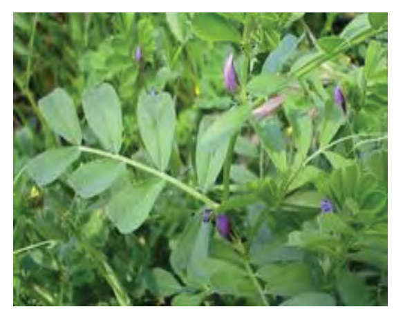
Figure 42: Vicia sativa L.