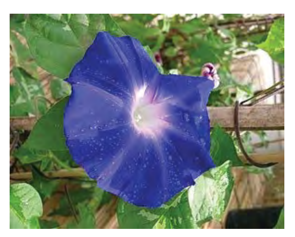
Figure 19: Ipomoea nil L.