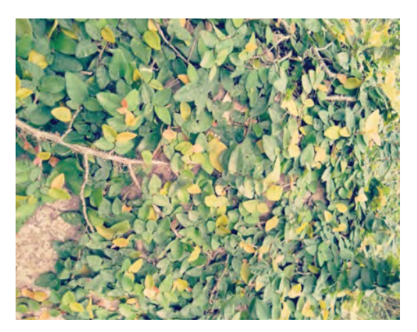
Figure 11: Ficus pumila L.