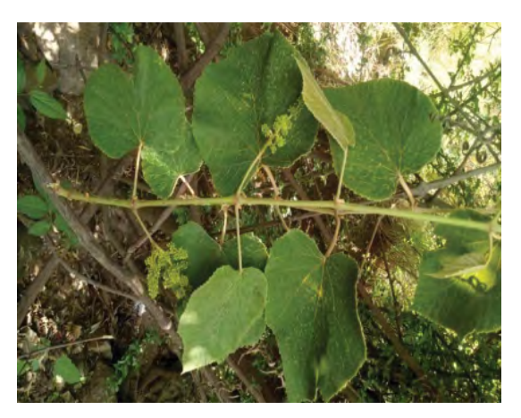
Figure 43: Vitis jacquemontii L.