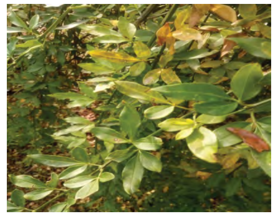
Figure 23: Jasminum dispermum Wallich.