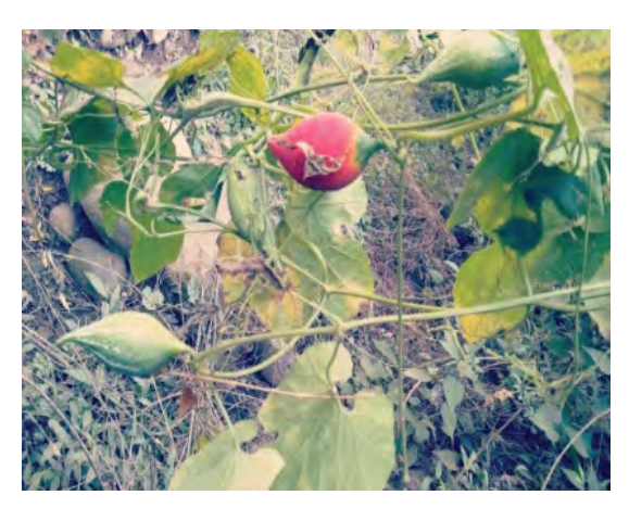
Figure 39: Trichosanthes cucumerina L.