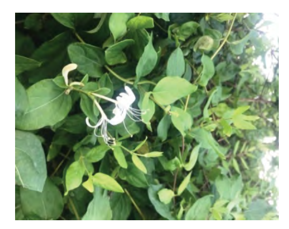
Figure 26: Lonicera japonica Thumb.