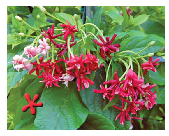
Figure 33: Quisquails indica L.