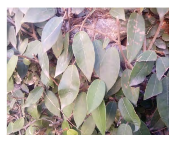
Figure 12: Ficus sarmentosa Buch-Ham.