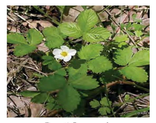
Figure 13: Fragaria vesca L.