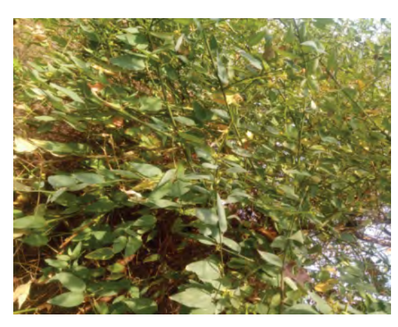
Figure 16: Helinus lanceolatus Wall.