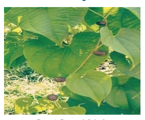
Figure 9: Dioscorea bulbifera L.