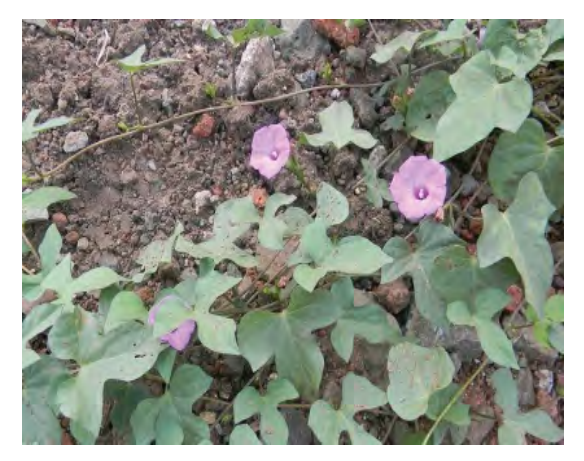
Figure 22: Ipomoea triloba L.