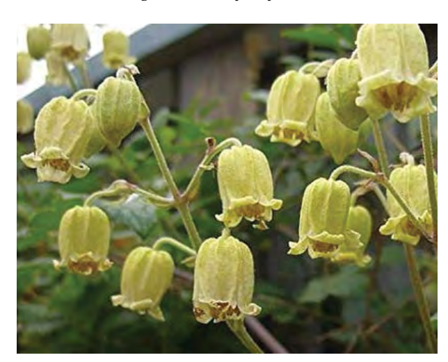
Figure 4: Clematis buchananiana.