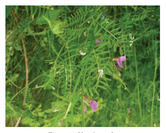
Figure 41: Vicia hirsute L.