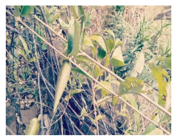
Figure 6: Cryptolepis buchanani Roem.