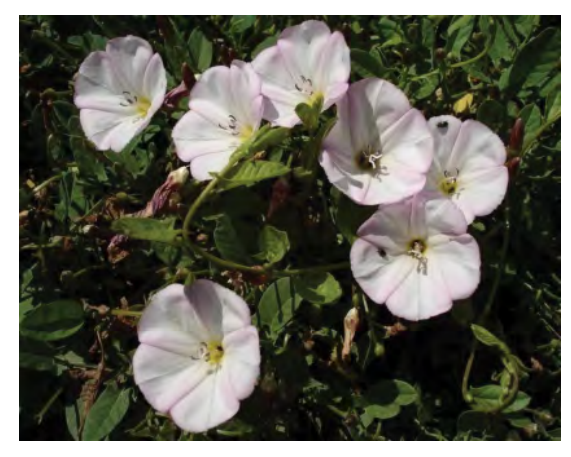
Figure 5: Convolvulus arvensis L.