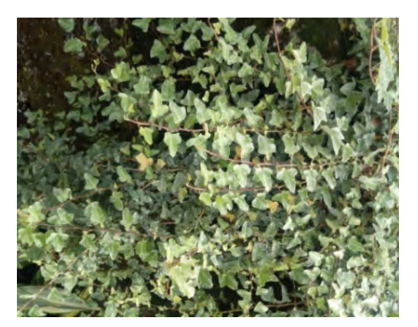
Figure 15: Hedera nepalensis K.