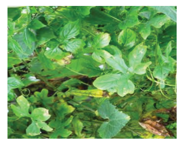
Figure 10: Diplocyclos palmatus L.