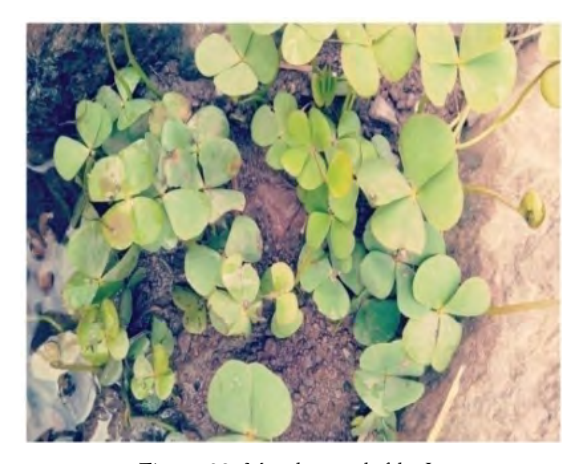
Figure 29: Marsilea quadrifolia L.