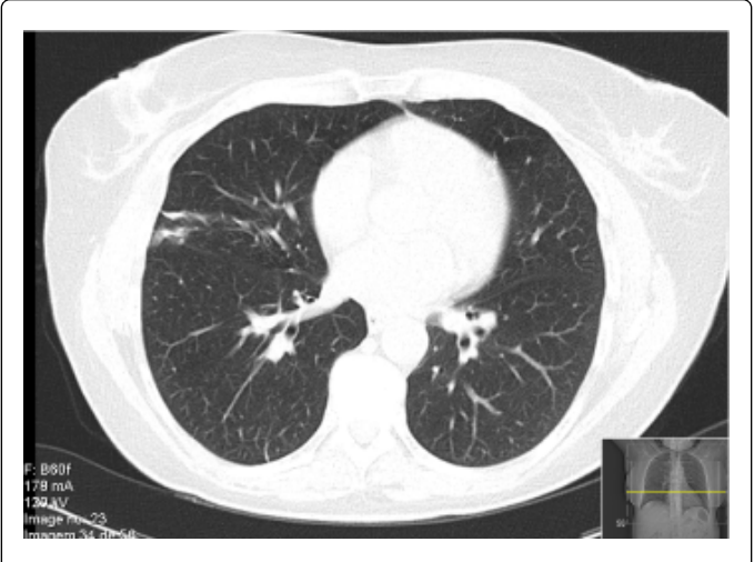
Figure 4: Reduction in the number and dimension of micronodules on follow-up chest CT one month after discharge.

After ten months of post-TB treatment, the patient had an episode of productive cough, dyspnea and fever with respiratory failure. After evaluation, a severe pneumonia and atelectasis were diagnosed. A rigid bronchoscopy (RB) was performed and revealed a tortuous trachea with reduction in diameter of the lower trachea and right main bronchus opening in 50%, which does not cause any resistance to the bronchoscope, but it returned to its original shape after the removal of the RB, which is suggestive of malacia. According to Pulmonary specialist consultation, prosthesis placement was not required.