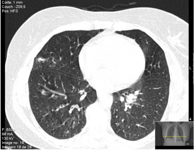
Figure 1: Chest CT revealed several centrilobular micronodules in the inferior lobe with a tree-in-bud pattern. After review of CT images, reduction in tracheal diameter was noted and complications as stenosis or tracheomalacia were suspected

On admission to the ER, the patient was afebrile and hemodynamically stable. Pulmonary auscultation revealed symmetrical respiratory sounds with bilateral crackles. Arterial blood gas (ABG) measurement revealed pH=7.19; PO<sub>2</sub>=102.5 mmHg; PaCO<sub>2</sub>=71.3 mmHg; HCO<sub>3</sub>-=27.1 mmol/L; SO<sub>2</sub>=96%; Lactates=0.95 mmol/L, with 100% oxygen mask; laboratory serum analyses were normal. Chest radiography (postero-anterior view) revealed lung opacity in the lower right lobe. Acid-fast bacilli (AFB) sputum smear remained positive. The patient worsened clinically, requiring intubation and invasive mechanical ventilation and she was admitted to Infectious Diseases Intensive Care Unit (ICU). Empiric antimicrobial therapy with amoxicillin/clavulanate and corticosteroid therapy with metilprednisolone were started; anti-TB therapy with INH, RMP, EMB and PZA were maintained. Rapid correction of respiratory acidosis was achieved and the patient was weaned successfully from mechanical ventilation 24 hours later. Corticosteroid therapy was changed to prednisolone 1 mg/kg/day.