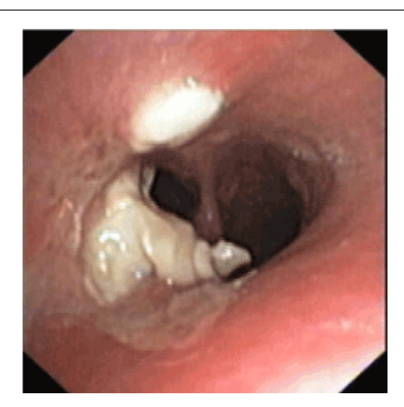
Figure 2: Caseum in tracheobronchial tree

desaturation. A chest CT was performed and, compared with the previous CT performed two months prior, revealed a reduction of the consolidation area in the right middle lobe, but persisting several centrilobular micronodules with a tree-in-bud pattern and an increased number of centrilobular micronodules in the inferior lobe suggestive of an infectious process (Figure 1). A fiber optic bronchoscopy (FB) was performed and a white gelatinous material suggestive of caseum was observed in the trachea and at the opening of right main bronchus causing a 50% lumen obstruction; no morphological alterations on the right and left main bronchus were observed (Figure 2). During bronchoscopic intervention a biopsy was performed; examination of trachea specimens showed a positive AFB smear and histology revealed areas of dystrophic calcification in hyaline cartilage and abundant fungal structures of Aspergillus spp. Galactomannan antigen test in sputum was also positive. Antifungal therapy with oral voriconazole was added to therapeutic regimen. The patient did well, recovered from all respiratory symptoms and was discharged home. Sputum baciloscopy and cultural exams were negative only after two months of anti-TB therapy.