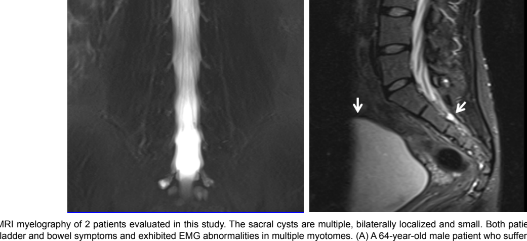
Figure 2: MRI myelography of 2 patients evaluated in this study. The sacral cysts are multiple, bilaterally localized and small. Both patients reported back pain, leg pain, and bladder and bowel symptoms and exhibited EMG abnormalities in multiple myotomes. (A) A 64-year-old male patient who suffered for almost 50 years from unexplained debilitating sacral and leg pain. (B) A 38-year-old female patient who suffered for 18 years from unexplained pelvic and leg pain and bladder issues. She harbored multiple small sacral cysts (one of them is visible under the right arrow) and had a significantly dilated atonic bladder (left arrow).

In our cohort, the first symptoms developed at 14-19 years old in 3 patients, in their 20s in 11 patients, in their thirties in 7 patients, in their