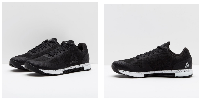
Figure 1: Shoes with flared outsole.

A crucial element of constructing a rehabilitation programme is sound gait analysis. This will largely be observational. Gait analysis consists of observation of the gait, which should occur from all angles. Knowledge of normal gait patterns for the prosthetic and non-prosthetic user is required to help analysis of movement. On observation of the gait the assessor compares the function of the amputee to expected patterns of gait and look for deviations [12]. Analysis of the gait pattern will help determine why these deviations are occurring. This will then help to formulate the rehabilitation programme, which includes correction of the deviations. Outcomes measures can be used to monitor progress [13,14].