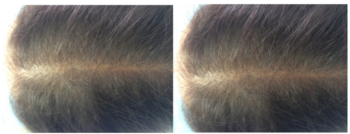
Figure 3: Scalp pictures of enrolled subjects (2 Group A (PRP+GFM-L) and 1 Group B (PRP alone)) at baseline and after treatment.