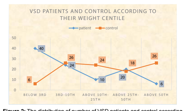
Figure 2: The distribution of number of VSD patients and control according to their weight Centile.